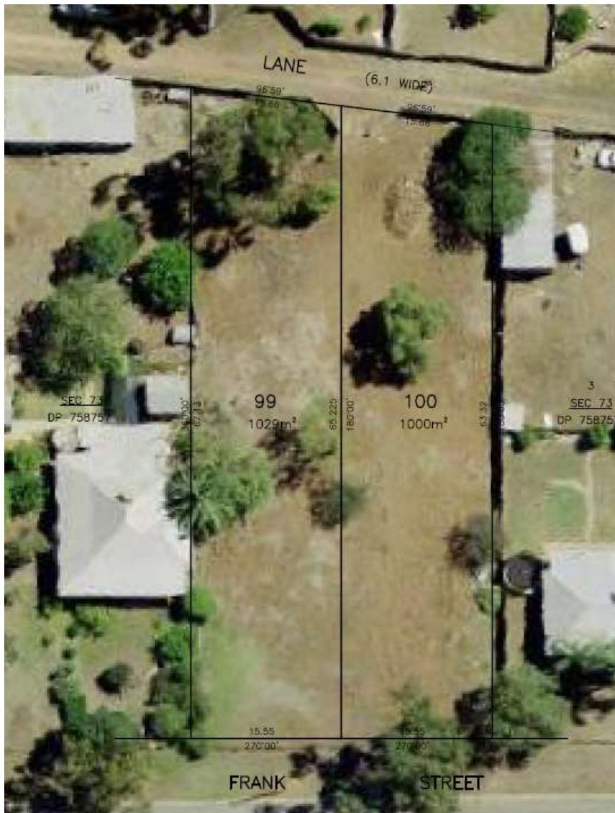
Image 3: Proposed Subdivision layout over aerial image, image from SIX Maps